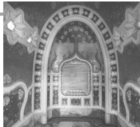
Budapest, Hungary — Schmidl family vault interior in the Kozma Utca Cemetery, 1904

Perhaps in a way, this was in Germany, in Mainz. There are the remains of one of the oldest medieval Jewish cemeteries in Europe. This 12th century site is next