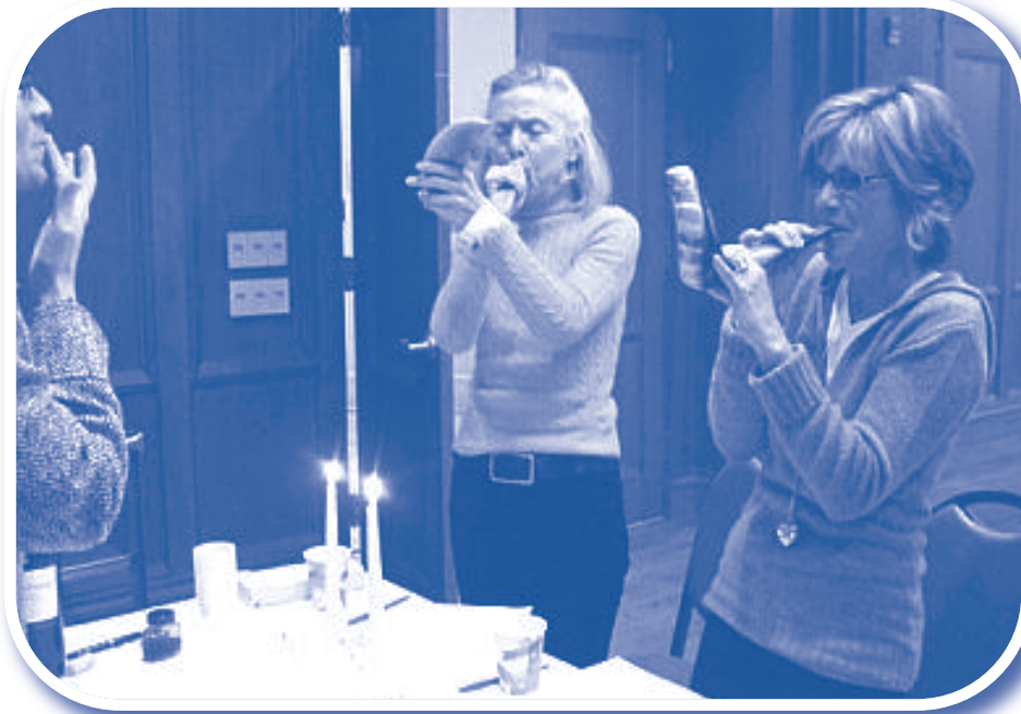
Members of our 2008-2009 Adult B'nei Mitzvah class learn how to blow the shofar during a special session about celebrating the holidays.