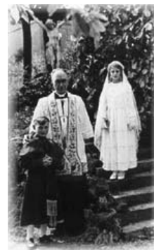
Children hiding under a different religion