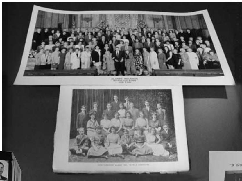
Above: Photos of the Religious School Alumni Reunion held June 4, 1995 (Shavuot 5755) and the Confirmation class of 1911

Wednesday classes were added in 1972 and Monday classes in the late 1990s. End-of-the-year activities featured both Closing Exercises and a Confirmation service.