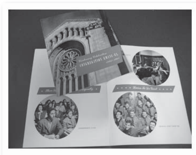
Bottom photo: Temple Emanu-El's Centenary Celebration booklet features Temple history as well as photos from various Temple groups, including the Women's Auxiliary, the Confirmation class and the Emanu-El Scout Troop.